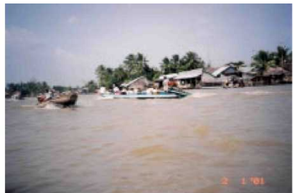
Photo 1. Traffic on the Mekong (Left) and traffic on a tributary of the Mekong