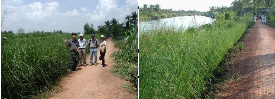
Photo 9. Very effective bank stabilization as well as fodder for livestock during flood