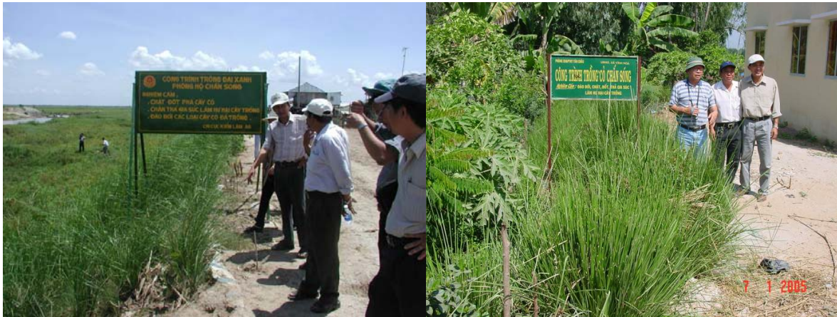
Photo 11. Implementing new policy to grow VS on new dyke (left) and population zone foots (right).

caused by wave generated from motorized boats.