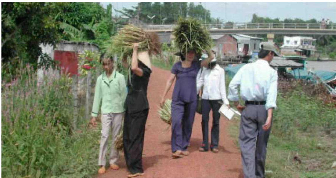
Photo 12. Taking home the goodies, ultimate appreciation of the Vetiver system