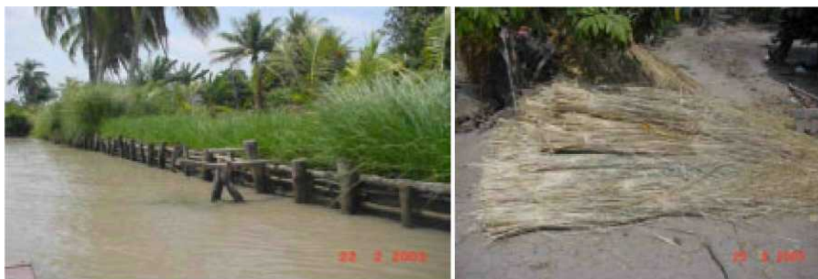
Photo 7. Reinforcing the wooden structure (Left) and being prepared for string

As rice growing is the main crop of this district, farmers also find another use for vetiver grass, it can be used as string to bind rice seedlings and rice straw. They prefer vetiver grass as it is pliant and tough, even more pliant and tougher than other kinds of strings commonly used: banana leaf, rush and Nipa palm string (Photo 7).