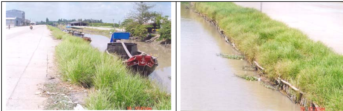
Photo 8 Vetiver dike protection

In Co Do District, Vetiver grass was planted at Co Do State Farm to protect the internal roads and stabilize the dykes and riverbanks. As the farm is located in low land regions of Mekong Delta, the erosion of riverbank, dykes and roads are very serious during flooding season. It has required a lot of money for annual maintenances. After 3 years of applying Vetiver Grass Technology, such erosions have been minimized (Photo 8).