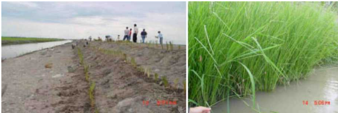
Photo 4. Vetiver grass planted on a dyke at the experimental site in Tri Ton (Left) and well established after the second planting, six months later

Authority in An Giang province is now planning to plant new sites immediately after the flooding season, or to plant it in the raining season to take advantage of the available soil moisture and to reduce care and water used for irrigation.