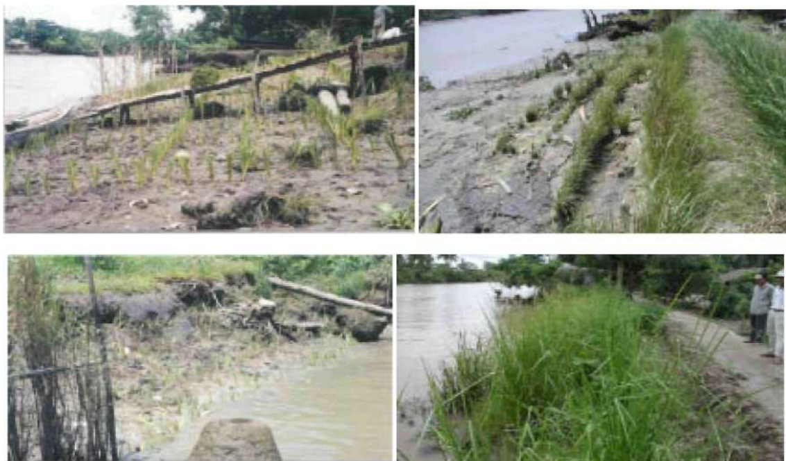
Photo 6. Newly planted on an eroded site (Left) and 8 months later

In Vi Thanh District, Vetiver established and grew very well, particularly those planted on higher ground to protect engineering structures. After two months, most of the grass is healthy, there was no dead grass and after 6 months, it grew to 1.8 m tall with 200 tillers/bush with well-developed roots, forming a thick carpet to fight against the stream bank erosion (Photo 7).