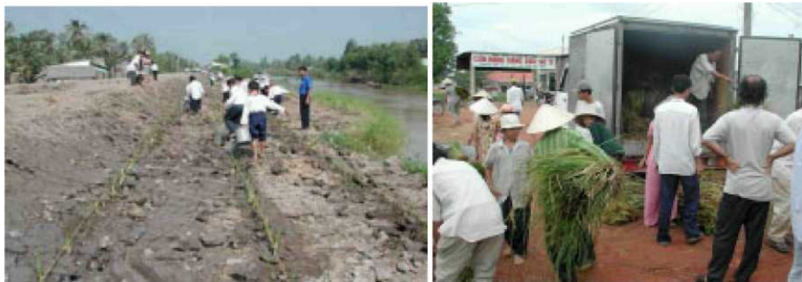
Photo 10. High school student planting vetiver as a part of their environmental study program (left) and vetiver distribution day

This program has been so successful and well known in the Delta that currently a TV series is being produced by the government for nation wide showing. It is really amazing that twelve months ago, all these people did not know or hear of vetiver, they are now using it not only for river and canal banks stabilization but also for fodder and strings.