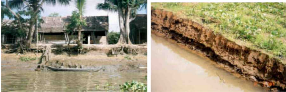
Photo 2. Erosion on the bank of a tributary (Left) and Erosion on the bank of the Mekong

Boats fitted with these engines produce huge waves and the severity of the problems is worse in remote areas as they need faster means of transportation. For example the erosion rate in canal banks in the southern end of the delta, the Ca Mau province, caused by these powerful boats, is a lot worse than that in the area around Cantho City, the capital of the Mekong delta (Photo 2).