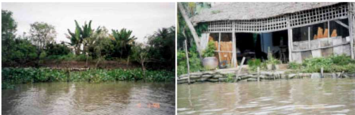
Photo 3 Vegetative method with water hyacinth (Left); Engineering method with sand bags

Water hyacinth and a local water plants ( Phragmites vallatoria L.) are commonly used to combat the erosion. Water hyacinth is a floating weed, which can choke up rivers and canals. Phragmites vallatoria L is a perennial grass up to 3m high, with erect, stout and hollow stem of about 1-1.5cm in diameter. The stems are not flexible and break easily under pressure. It has a relatively shallow root system of about 0.5m depth. But due to various reasons, the vegetative means of bank stabilisation used locally are not effective or at best provide only temporary relief (Photo 3).